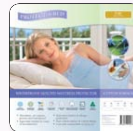
PROTECT·A·BED® Quilted Mattress Pad