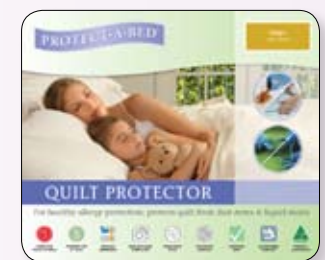
PROTECT·A·BED® Waterproof Quilt Protector