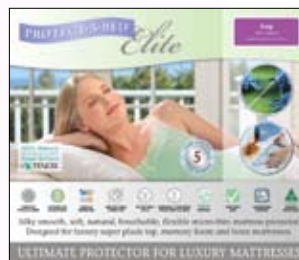
PROTECT·A·BED® Elite Mattress & Pillow Protectors