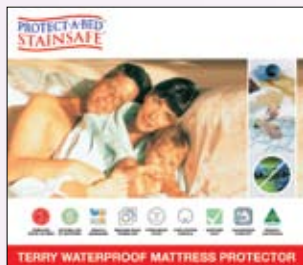
PROTECT·A·BED® StainSafe™ Mattress & Pillow Protectors