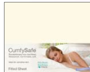
PROTECT·A·BED® CumfySafe® Waterproof Linen