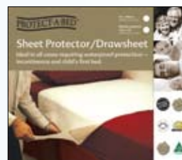
PROTECT•A•BED® Linen Protector/Draw Sheet