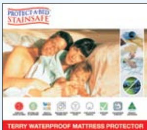
PROTECT•A•BED® StainSafe™ Mattress & Pillow Protectors