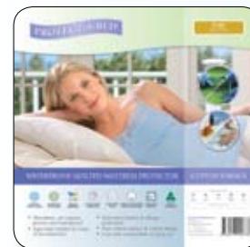
PROTECT•A•BED® Quilted Mattress Pad