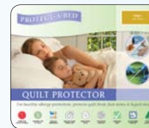
PROTECT•A•BED® Waterproof Quilt Protector